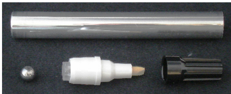
200 empty - all marker components

237 Black 272 Natural – Opaque 273 Fontana – Opaque 274 Light Tan – Opaque 275 Light Walnut-Opaque 281 Pure White 283 Light Almond 285 Pearl White 289 Pickle Frost 290 Meadow Green 291 Forest Green 200 Assortment-all 33 colors 200 tip Replacement Tips 200 empty Marker Components Custom Colors (144 minimum)