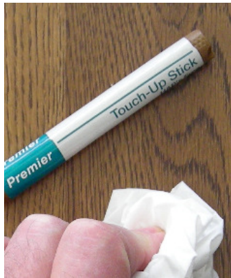
buff off excess with a soft cloth