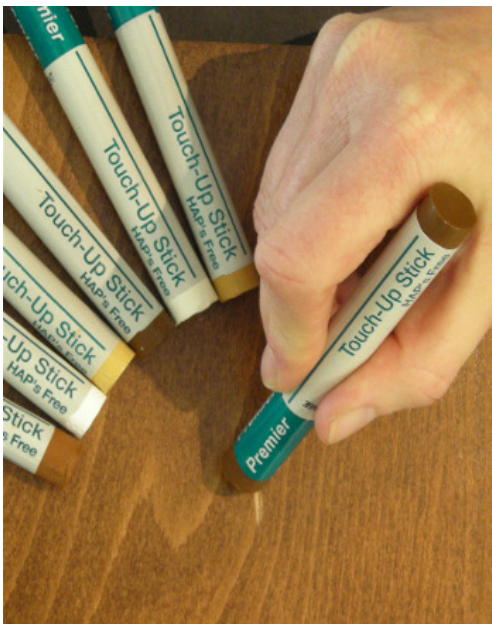
rub back and forth over void

Our wax repair sticks are used for repairing small gouges, scratches or nail holes on an already finished surface. Our touch-up sticks are very easy to use, you simply rub the stick back and forth over the area pressing down evenly. After the void is filled you can either buff off the excess with a soft cloth or plane the excess off with a plastic putty knife (or credit card). If desired, the repaired area can be carefully colored with a marker and/or clear-coated. The Premier Touch-up Sticks are formulated using the newest and best waxes and pigments available resulting in a product that is very easy to use and will give long lasting results.