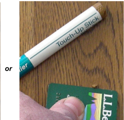
scrape off excess with a plastic putty knife

101 Transparent 102 Natural 103 Natural Light Oak 104 Sandstone 105 Wheat 106 Honey Maple 107 Natural Red Oak 108 Light Pine 109 Light Oak 110 Red Oak 111 Colonial Maple 112 Fruitwood 113 Heritage Oak 114 Maple 115 Universal Cherry 116 Light Walnut 117 Medium Cherry